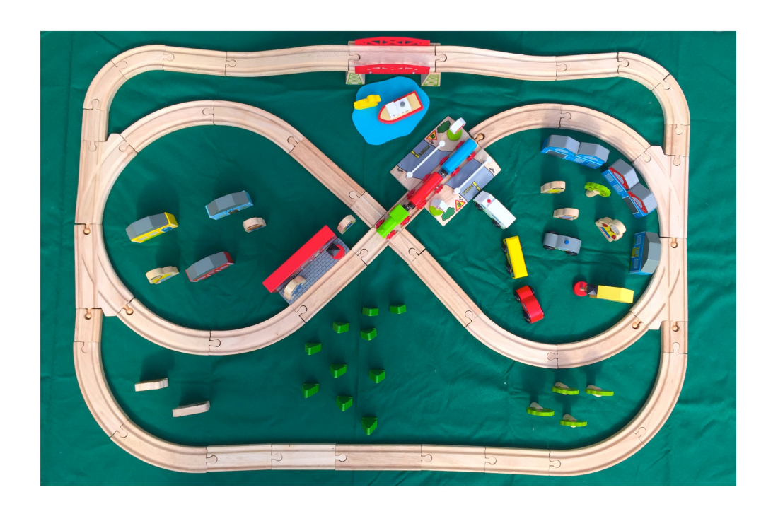
Map – What can you see?